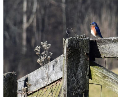
Local wildlife spotting

Be sure to check out their 40th Anniversary Event on August 26th!