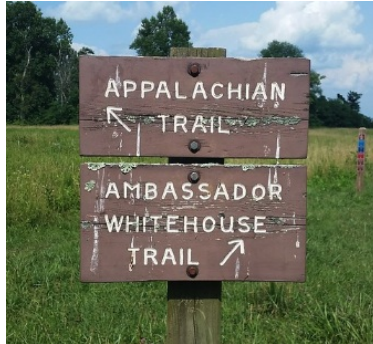
Signage for trails